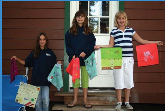
Participants making quilt squares at Camp Solace